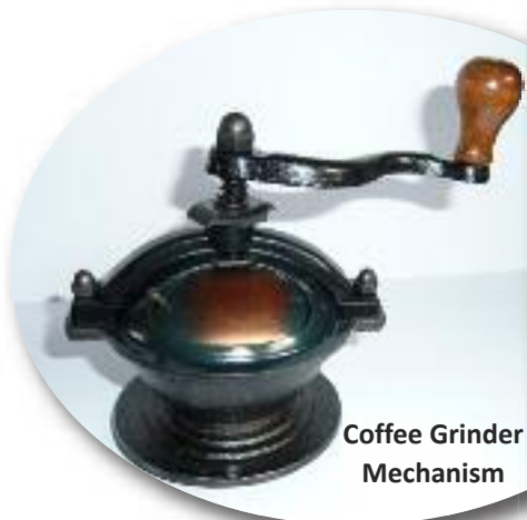
Coffee Grinder Mechanism