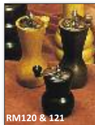
RM120 & 121